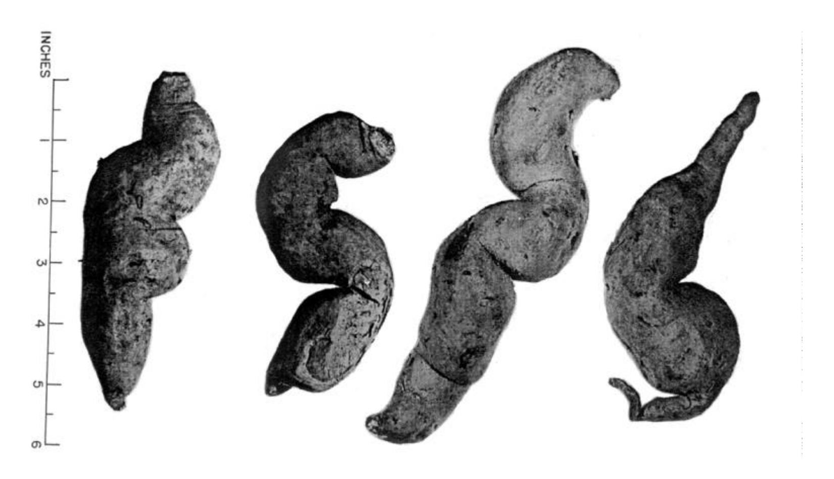
SHAPE - NOT FAIRLY WELL SHAPED No usable piece available