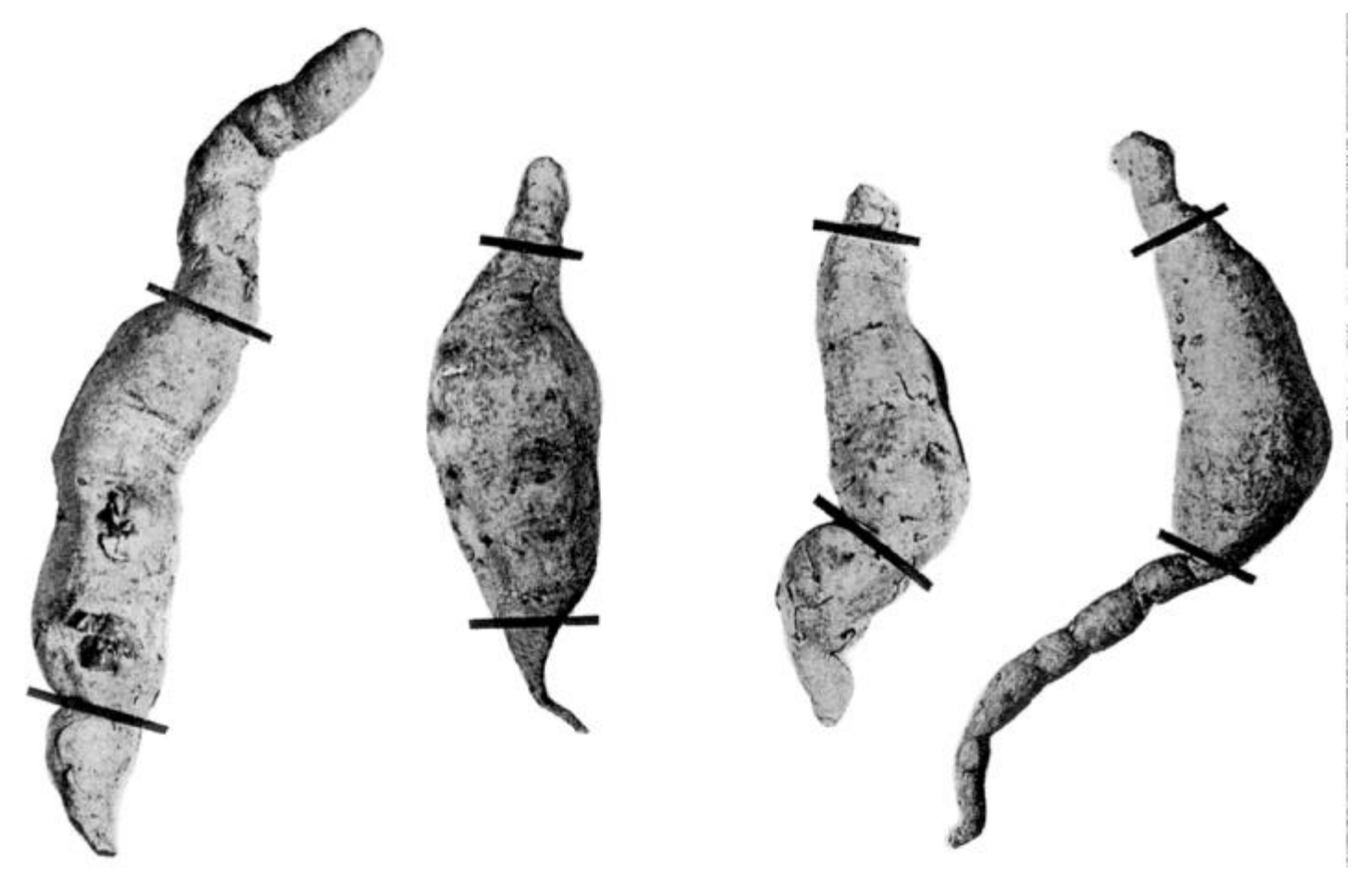
SHAPE - FAIRLY WELL SHAPED One usable piece available