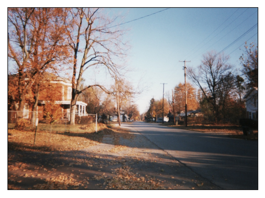
Figure 3-1: People often choose to live in rural areas for a more relaxed quality of life and closeness to nature.

In brief, this chapter shows that an efficient system of freight transportation is an important foundation for a vibrant rural economy, including rural manufacturing. Transportation, however, does not stand alone, but is one of several key elements that contribute to a strong rural economy. Many other factors also help create and support a high quality of life in rural communities. In this chapter, we compare some crucial economic and demographic attributes of rural America with metropolitan areas. We also describe variations of rural areas along several other dimensions, in order to explore the implications for the needs, successes, and benefits of freight transportation. The requirements for freight transportation vary.