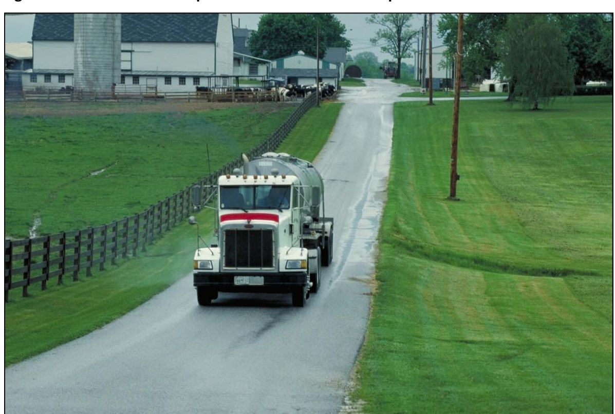
Figure 3-3: Rural America depends on trucks to move its products.

The stereotype of the rural economy focuses on agriculture but, in reality, the picture is more complex. As shown in Figure 3-4, agriculture is far from the largest employer in rural America. Four other economic sectors—services, government, retail and wholesale trade, and manufacturing—comprise 80 percent of rural employment. Agriculture is responsible for less than one in ten rural jobs. However, because agriculture is so capital intensive, the economic activity generated by it is greater than the job opportunities it creates. The interaction of agriculture and the off-farm jobs it supports provides a solid base for many rural communities. A solid transportation system is a critical foundation for success in all the economic sectors of rural America.